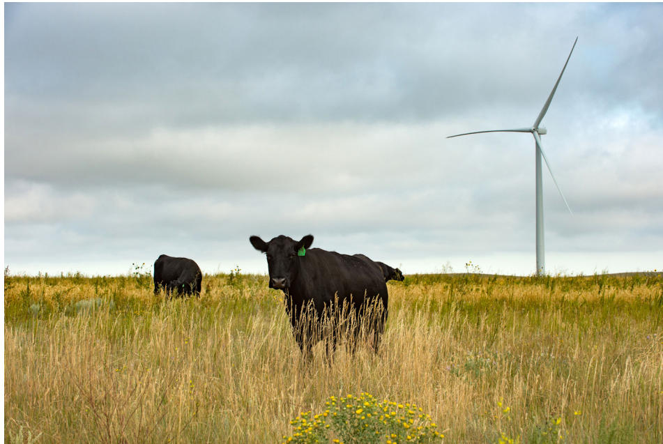
Golden West in El Paso County

*Includes megawatts associated with noncontrolling interests related to XPLR Infrastructure, LP