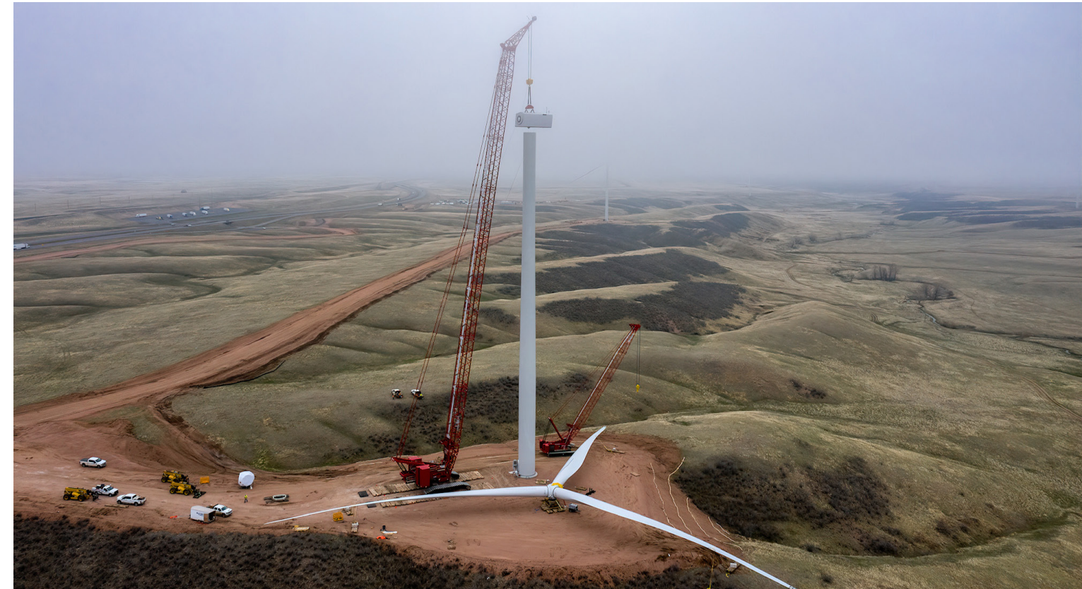
Our goal is to have our general contractor hire as many local construction workers as possible for projects like the Roundhouse Wind Energy Center in Wyoming.