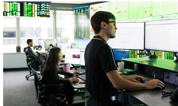
The NextEra Energy Resources Renewable Operations Control Center in Juno Beach, Florida, provides remote operations support to NextEra Energy Resources' wind, PV solar and energy storage sites.

Right behind safety is training. NextEra Energy Resources' wind technician training includes online learning, classroom training and field training. Our company also has working partnerships with two colleges in Texas to provide on-site training for our technicians. Additionally, through courses taught at the colleges and supported through our partnerships, the colleges serve as pipelines for future wind technicians. We also provide support to other technical colleges.