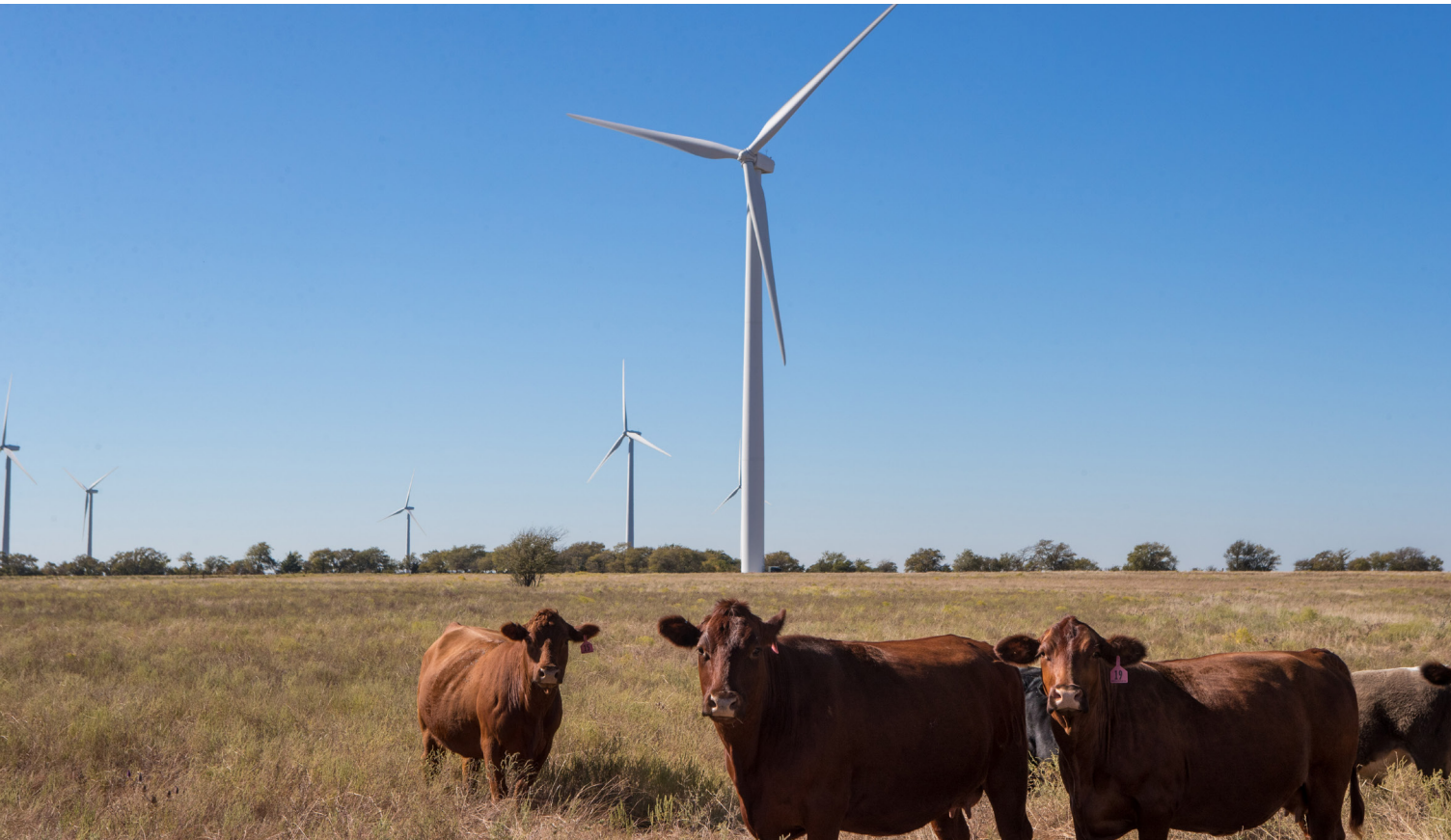
Wind energy, produced at wind farms like the 112.5-megawatt (MW) Wolf Ridge Energy Center in Texas, provides a reliable long-term income for ranchers and farmers, and acts as a drought-resistant crop.