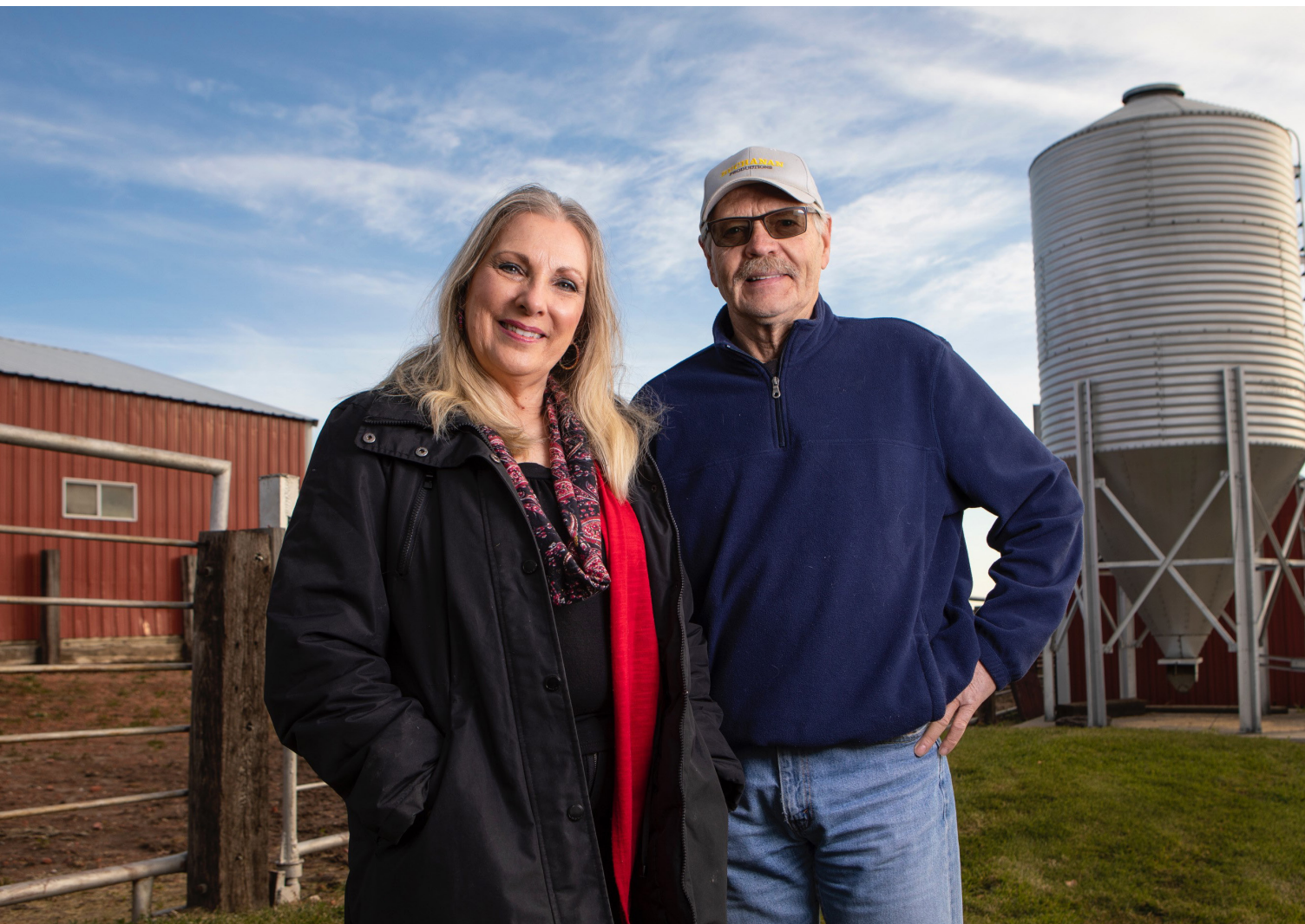
Wind farms allow landowners to continue to use their land while diversifying their income.